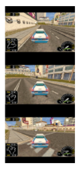
Radar #3: minimum speed: 230 mph

Remember radar #3 in California and Canada? Yeah! That's right! You have to go through the palm trees trying to keep your speed. Floor it as soon as you're between the trees aiming for the front of the police car.